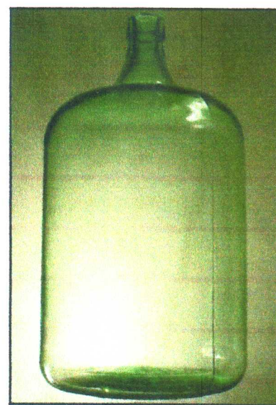
Figure 9 – Carboy (eBay)

manufacturer's name and city, seen on an advertising paperweight, reported to me by Bob Berkley."